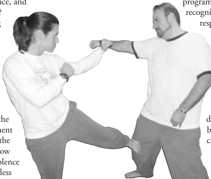
Above and right: Students from a recent self-defense class demonstrate some techniques.

Self-defense thoughts and behaviors are intrinsically assertive , rather than passive or aggressive. This idea